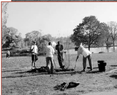
Trees being planted by our dedicated, tireless volunteers