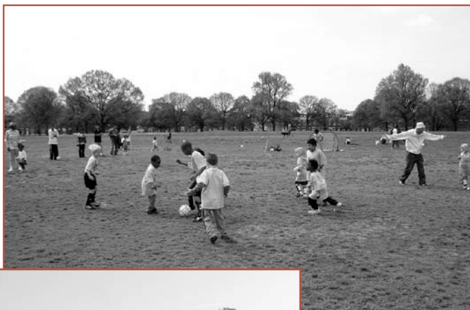
Kids enjoying our new soccer league