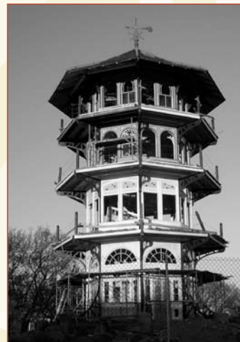
Patterson Park's famous Pagoda, seen here before its re-opening after much needed renovation in 2002.