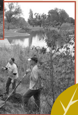
Top: Concert goes on Pagoda Hill. Middle: Youth Volunteer Day. Bottom: Tree Planting by the Boat Lake.