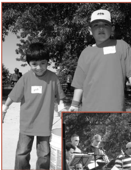
Two of our youngest volunteers