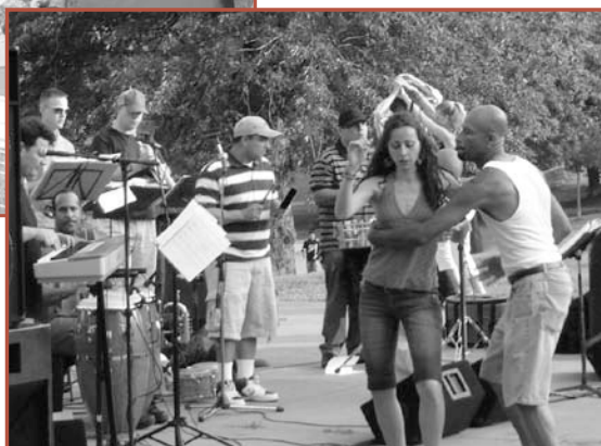
Park Neighbors enjoying our Salsa concert